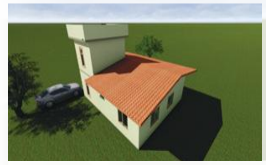
3D graphical illustration of a model rescue house (before flood)

During the study, nature and magnitude of the problem related to flood damage including socio-economic impact was investigated for selected areas in Matara, Kalutara and Galle Districts, the areas highly affected due to floods in 2016 and 2017. Experimental models for minimizing the damages to structures were studied at Bath University, UK. The study was concluded with the findings to improve the flexural strength of masonry walls using steel reinforced mesh, constructing a cost-effective refuge space which can be used as part of the house or building and having upper floors to escape in case of flash floods. Implementing these findings at field level will enable to minimize structural damages to buildings and negative socio-economic impacts due to floods in future. Further, improvement of cost-effective construction of the refuge space by incorporating innovative building materials (e.g. waste-based building materials) are being researched at the laboratory level.