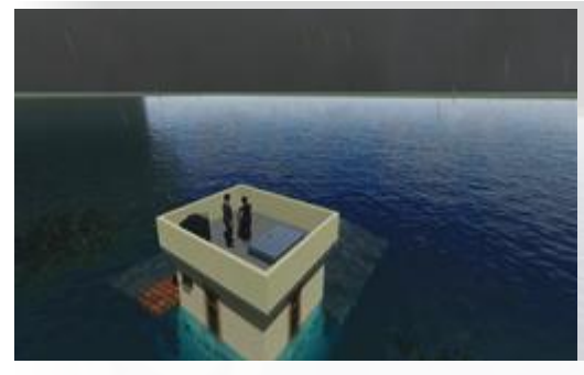
3D graphical illustration of a model rescue house (after flood)