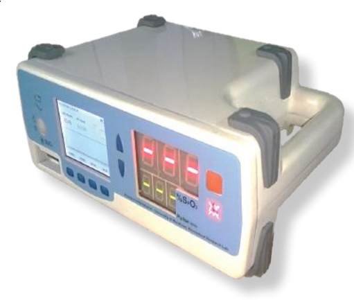
Locally developed Pulse Oximeter

A commercial prototype of medical grade Pulse Oximeter as a competitive product on par with other similar products in the local market has been developed by a team of researchers of the University of Morauwa with the financial support under the Technology Grant Scheme. The Premium International (Pvt) Ltd. has linked up with the university team to bring this product to the market. The Pulse Oximeter is a non-invasive device which is used to monitor blood oxygen level. It is a critical life-saving