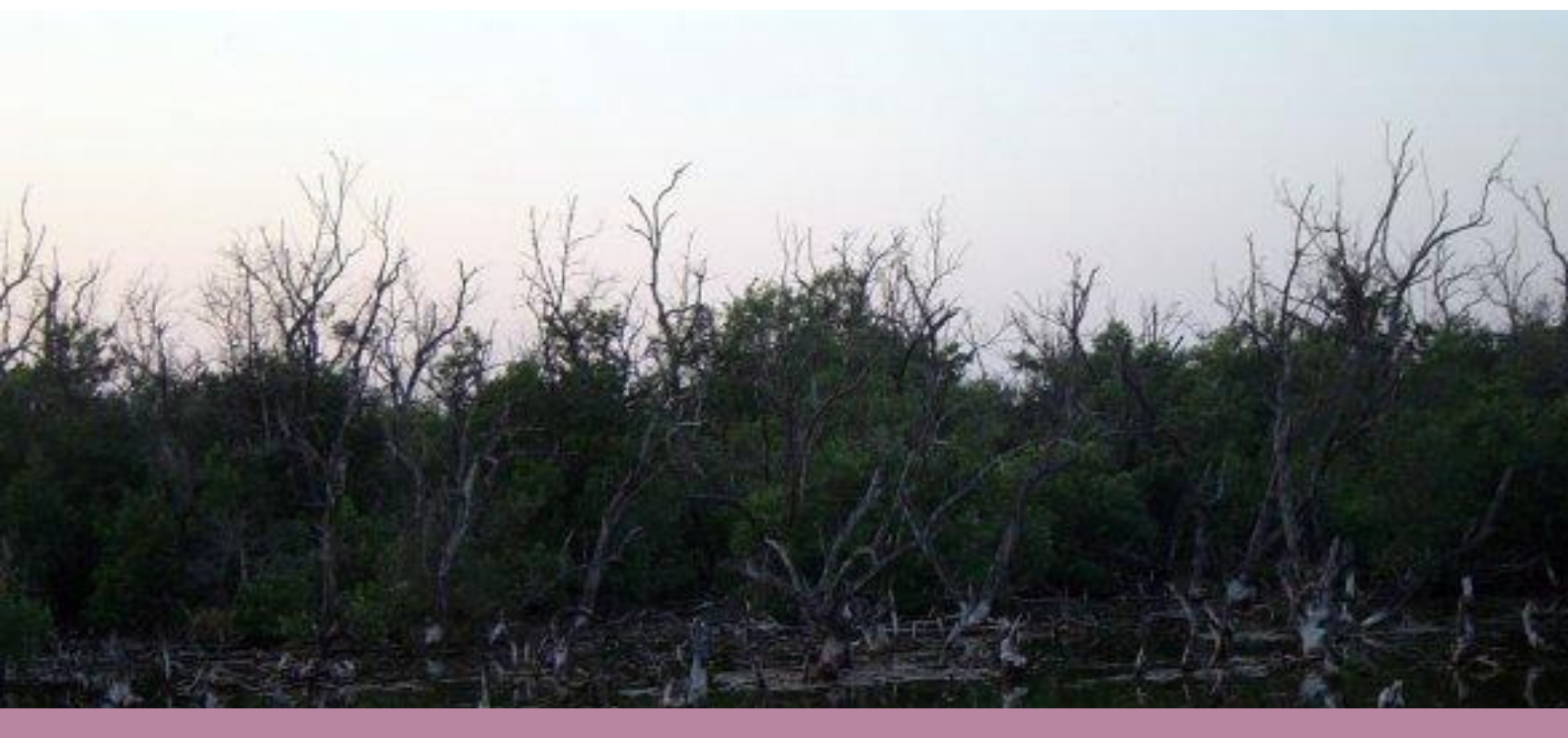
Prepared by The National Science Foundation